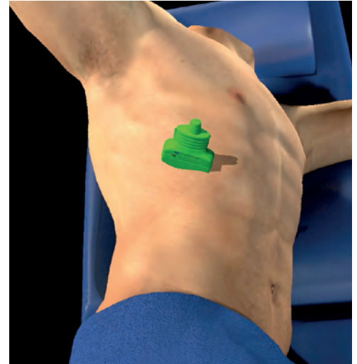
Traffic light display of the virtual probe demonstrates correct orientation

After each lesson, trainees can switch off ScanTutor and test their own skills performance against set metrics. If they do not master the lesson first time, they can switch ScanTutor back on to go over key learning points, take the test again and then move onto the next lesson.